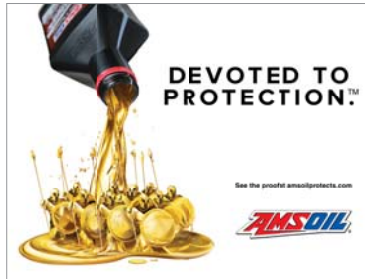
Window Decal 9"x12" (G3356)