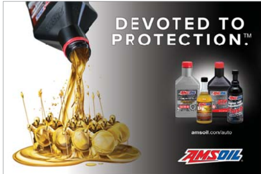
Retail Counter Mat (G3351)