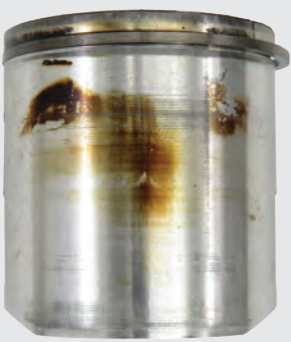
AMSOIL SABER Professional 300 Hours

Following 300 hours of professional-use testing in STIHL* string trimmers at the manufacturer mix ratio of 50:1, SABER Professional kept pistons and rings virtually free of carbon and wear (see the picture on the top), while use of a leading oil brand caused significant carbon buildup around the ring area (see the picture on the bottom). This engine is nearing the failure point.