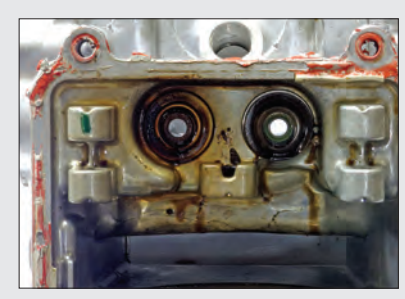
AMSOIL 10W-30 Synthetic Small Engine Oil 125 Hours

Following 125 hours of severe-service testing in a Honda* 5-hp engine, 10W-30 Synthetic Small Engine Oil kept the valve guides in the engine pictured on top clean and functional. In contrast, using a leading oil brand, the engine pictured on bottom failed due to exhaust valve sticking. During engine disassembly, heavy deposits prevented test administrators from removing the valve.