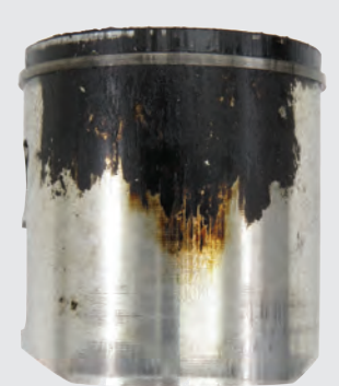
Leading Oil Brand 300 Hours