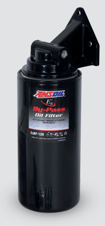
Fittings and hardware not shown

The Heavy-Duty Bypass Filtration System is constructed of high-quality cast aluminum with a steel filter spud that has been thoroughly tested in on-road and severe off-road service. The mount is finished with a thick layer of powder-coated paint to provide maximum resistance to the degrading effects of road salt, debris and engine-compartment chemicals.