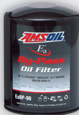
EaBP90 • EaBP100 • EaBP110 • EaBP120

AMSOIL Ea Bypass Oil Filters provide maximum filtration protection against wear and oil contamination. Working in conjunction with the engine's full-flow oil filter, AMSOIL Ea Bypass Filters operate by filtering oil on a "partial-flow" basis. They draw approximately 10 percent of the oil sump's capacity at any one time and trap the extremely small, wear-causing contaminants that full-flow filters can't remove. AMSOIL Ea Bypass Filters typically filter all of the oil in the system several times an hour, so the engine continuously receives analytically clean oil.