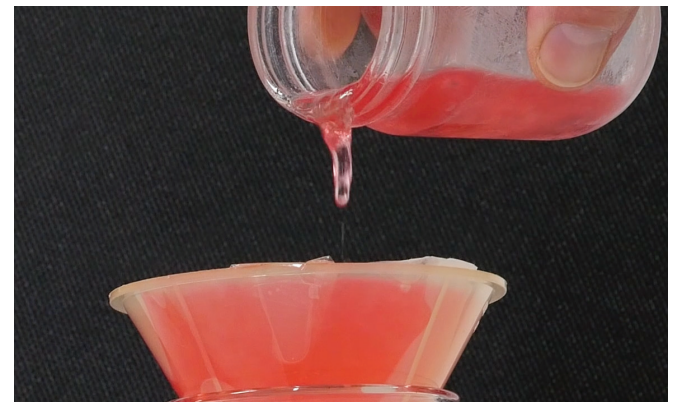
Wax formation in untreated diesel fuel resists pouring.

lowers the cold filter-plugging point (CFPP) by up to 40^\circ\text{F} (22°C) in ULSD.