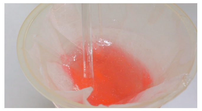
Wax formation in untreated diesel fuel plugs a coffee filter.