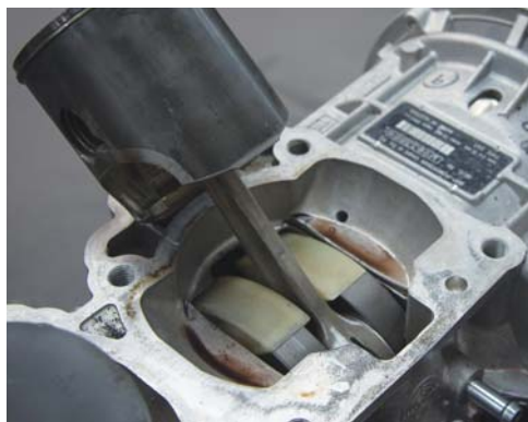
The pistons suffered only minor scuffing.